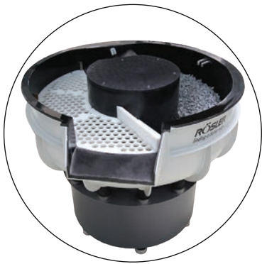
Rotary Vibratory Deburring