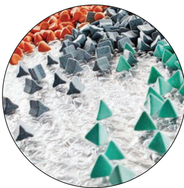
Ceramic - Plastic - Steel Media